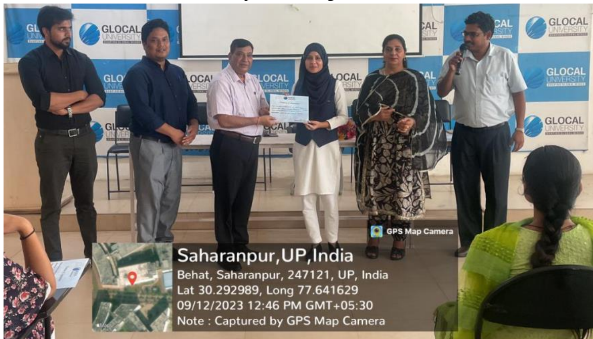
Source: Gender Awareness Session on 12 th September 2023

Glocal University has a dedicated policy to support women's applications, acceptance, entry, and participation in higher education. We are committed to fostering gender equality and ensuring accessible education for women at all levels. Our "Sukanya" scheme provides free education for girls from underprivileged backgrounds, encouraging more women to pursue higher education without financial barriers. Additionally, we have targeted outreach and counseling programs to guide female applicants through the admissions process and to offer mentorship. By creating an inclusive and supportive environment, we aim to empower women to achieve their academic and professional goals.