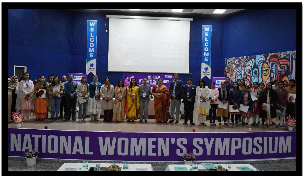
National Women's Symposium organized on 10 th August 2023 at Glocal University

At Glocal University, we view gender equality as a collective responsibility and an essential element in achieving a sustainable future. By championing SDG 5, we aim to inspire transformative change, empower our community, and contribute to building a more equitable world.