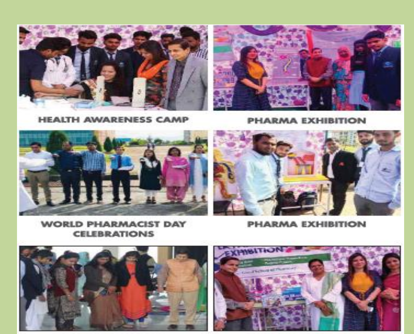
PHARMA RANGOLI COMPETITION