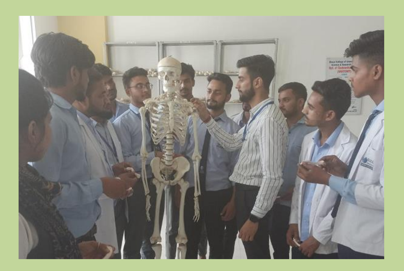
In 2022, Glocal University organized a comprehensive Health Awareness Program, underscoring its commitment to the holistic well-being of its student body. The event featured a series of informative sessions, workshops, and health check-ups aimed at promoting a proactive approach to personal health. Faculty members, along with healthcare professionals, shared valuable

In 2022, Glocal University organized an exhilarating Sports Event that brought together students in a spirited showcase of athleticism and camaraderie. The event featured a diverse range of sporting activities, including track and field events, team sports, and friendly competitions. Students displayed exceptional skill, determination, and sportsmanship throughout the event, creating an electrifying atmosphere on campus. The Sports Event not only served as a platform for healthy competition but also encouraged teamwork, discipline, and physical fitness among the participants. The winners, recognized for their outstanding performances, became a source of inspiration for the entire university community. This sports extravaganza not only contributed to the overall well-being of students but also strengthened the sense of community and pride within Glocal University, making the 2022 Sports Event a memorable and impactful experience for all.